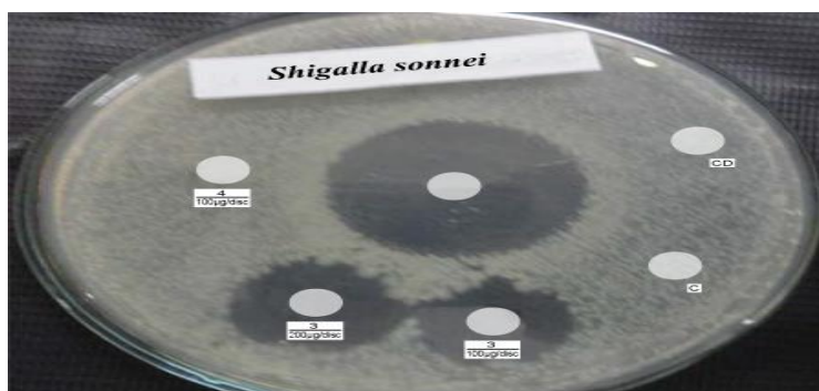
Fig: 5.0: Photographic representation of zone of inhibition of the complexes 3 the standard compound kanamycin against Shigallsonnei